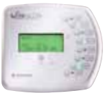
EasyTouch System Indoor Control Panel (for 4 or 8 function control)